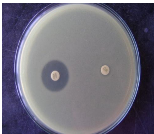
Figure 2: Inhibitor based method for AmpC production:

The cefoxitin-cloxacillin disk diffusion test was performed as described by Tan et al. The test is based on the inhibitory effect of cloxacillin on AmpC. In brief, 30- \mu g cefoxitin disks were supplemented with 200 \mu g cloxacillin. The test strain was inoculated on Mueller-Hinton agar. The diameters of the cefoxitin inhibition zones were compared with and without cloxacillin; if the difference in inhibition was \geq 4 mm, the strain was considered positive for AmpC production. Isolates showing zone diameter around the disk containing CXX (cefoxitin + Cloxacillin) \geq 4 mm than the zone diameter around the disk containing CX alone in the figure below